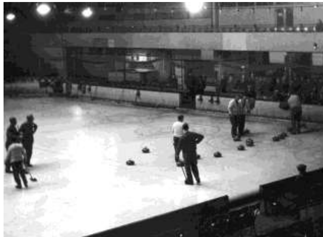
Ayr's old ice rink at Beresford Terrace

AFSC was formed in 1958 at Ayr Ice Rink, Beresford Terrace. The first club competition was held the following year. Sadly in 1972 the shareholders of the rink were made such a good offer by the supermarket chain "Safeway" that the rink closed.